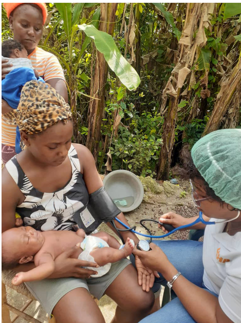
Healthcare comes to the home via our perinatal outreach program.