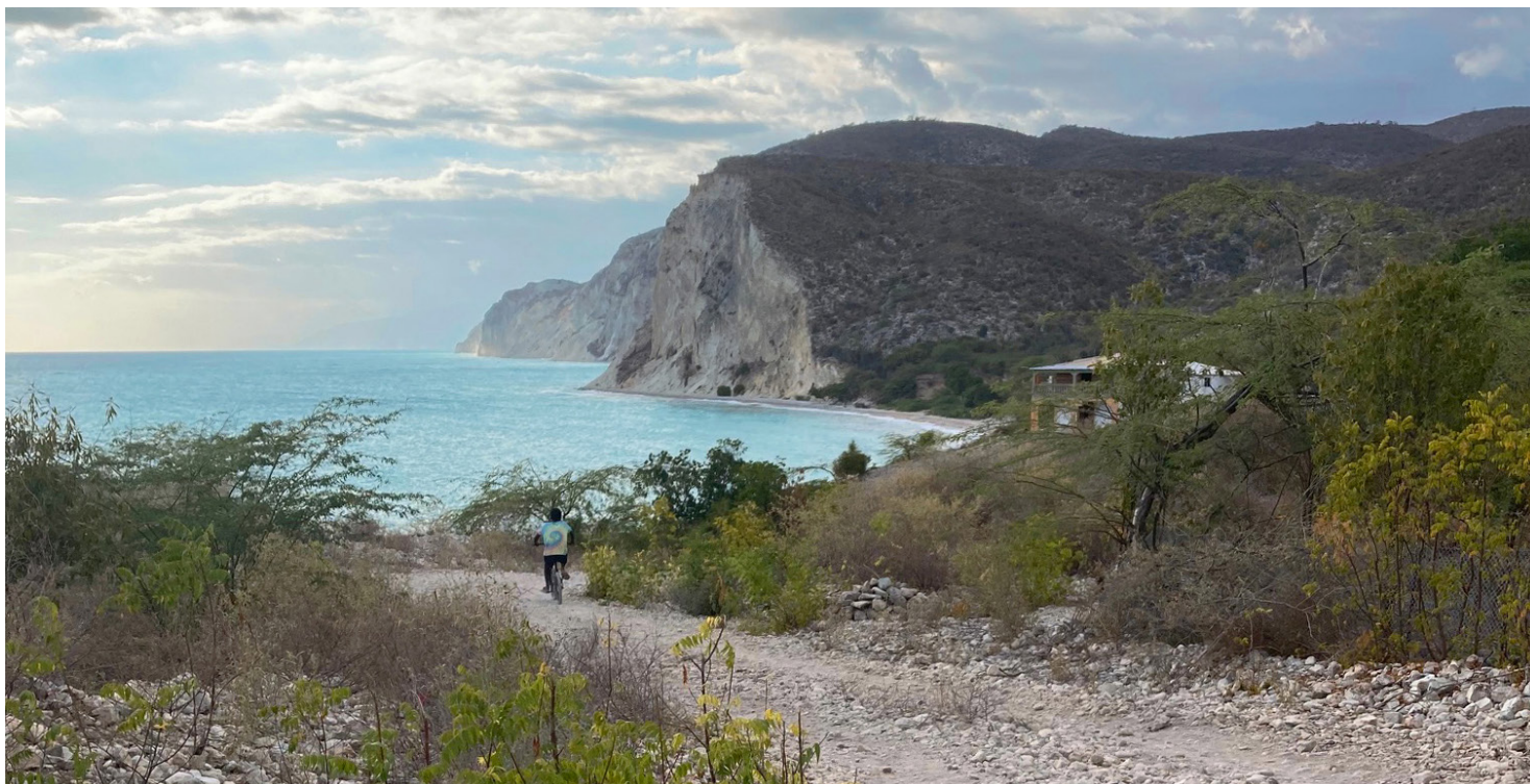
A typical stunning view in the rugged Southeast