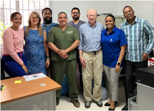
The international team

After meeting in 2024 with international partners in Pedernales, Dominican Republic, we look forward to providing surgical services within reach of all our patients.