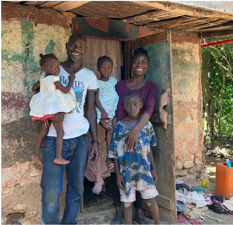
A family exits the vicious cycle of hunger by using local, sustainable solutions.

Since the program began in January of 2023, 1,500 female heads of households have had their children screened for malnutrition and received training about how to improve their families' nutrition. So far, 185 malnourished children have "graduated" from our program.